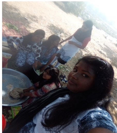
We went Picnic with students for One day