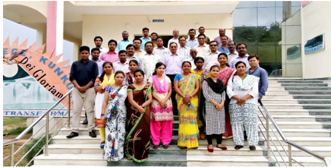
Loyola college Staff members