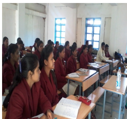
Students attending Guest Lecture