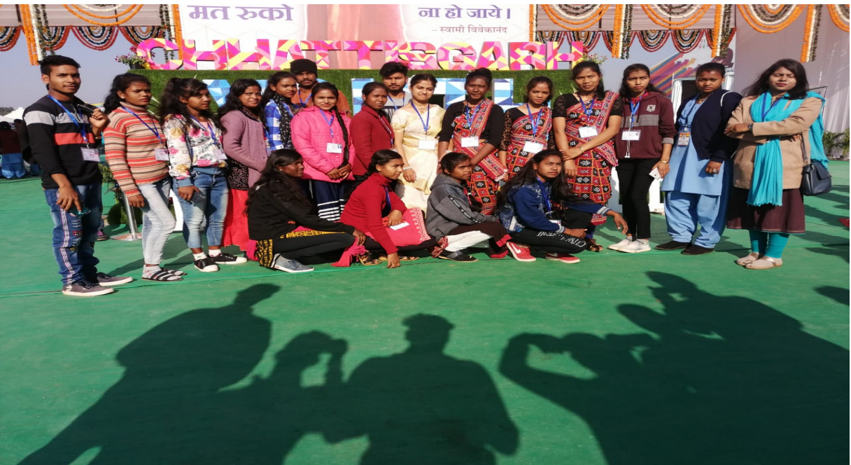
State level competition