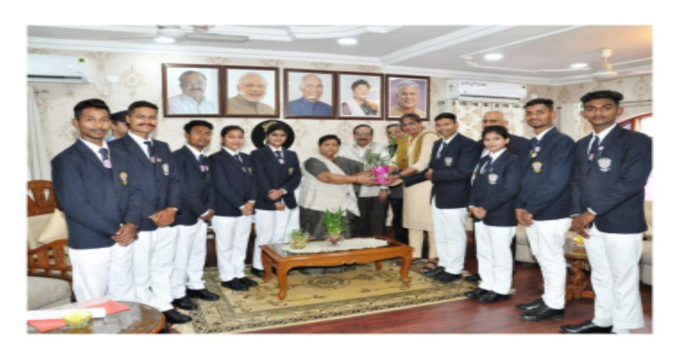
our honorable Governor Anusuiya Uikey