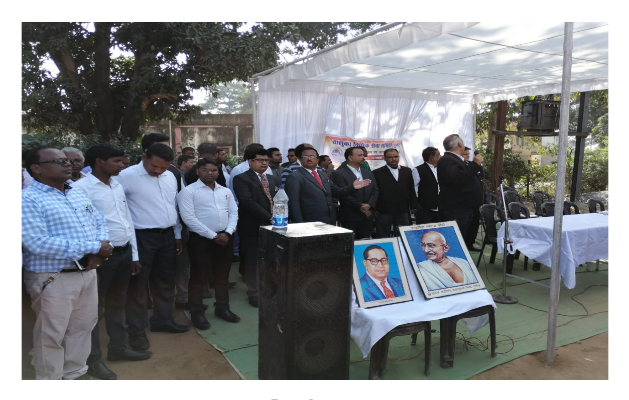
Legal awareness camp