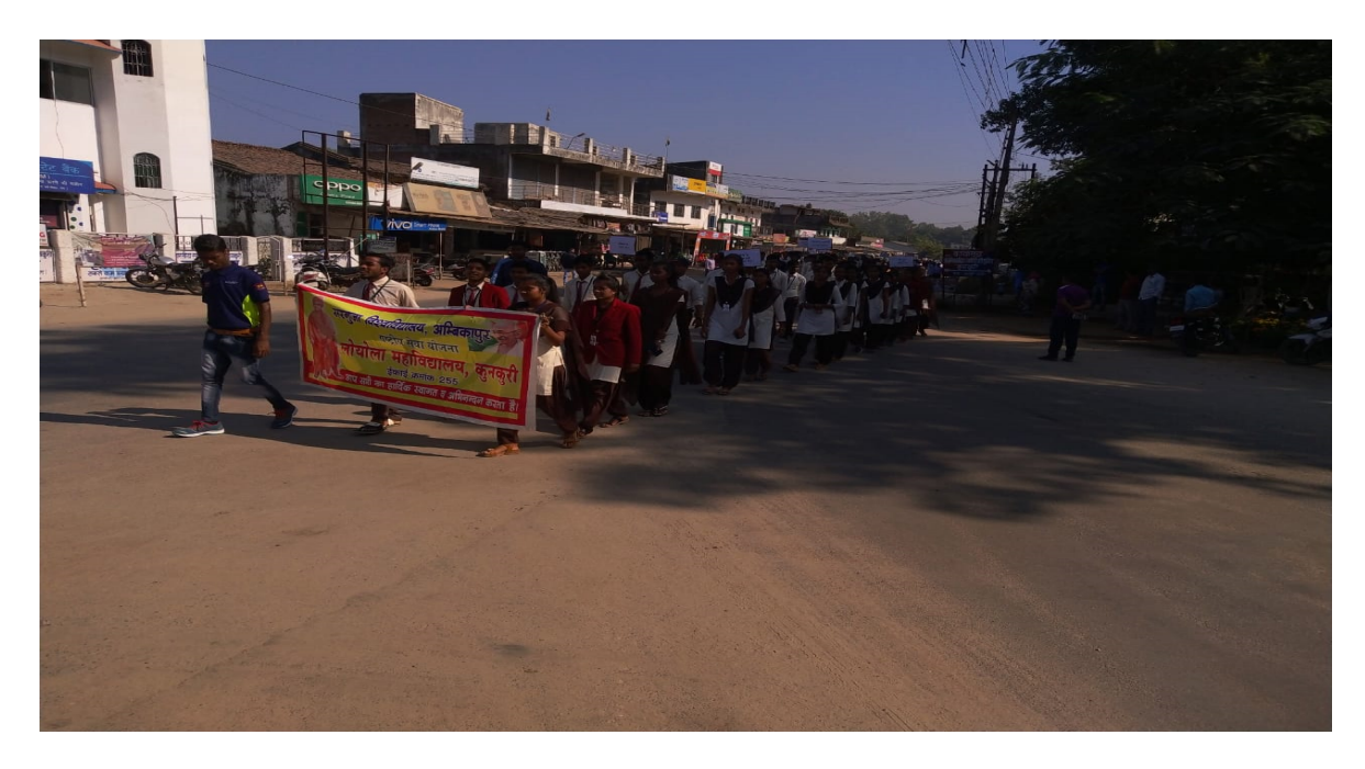
Plus polio rally