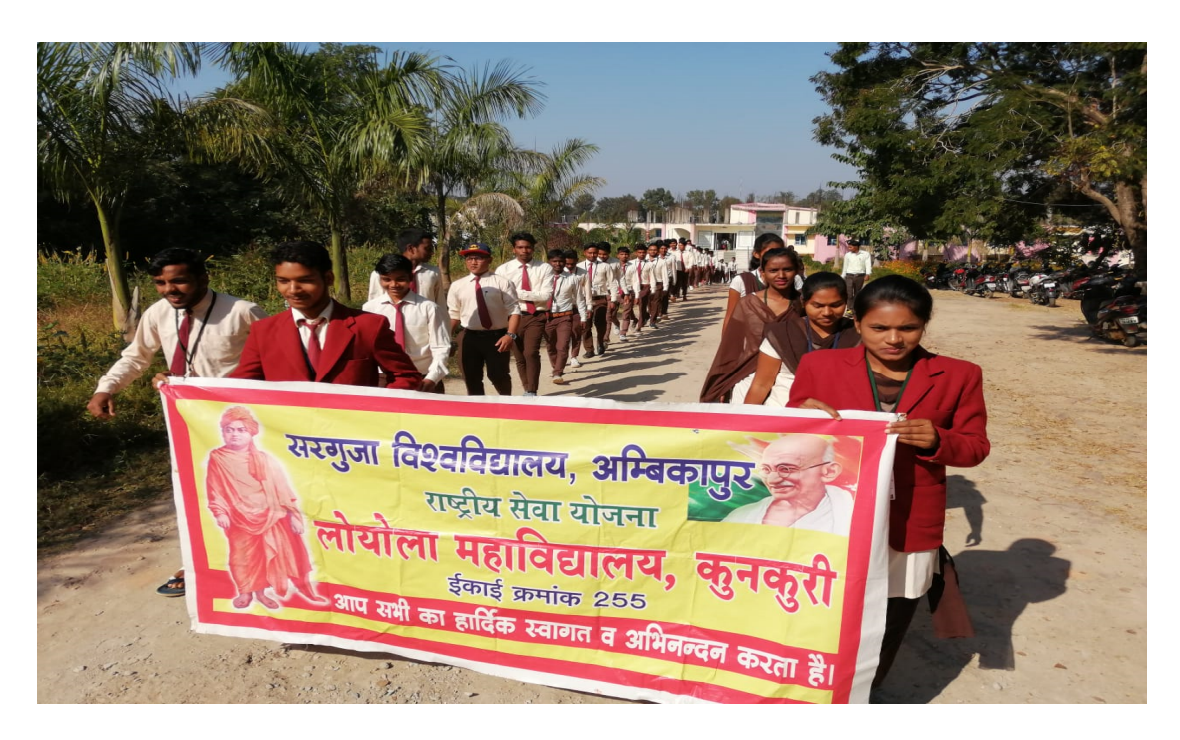
Population control rally