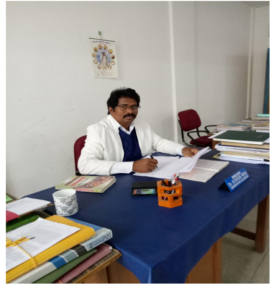
DEAN Arts Department