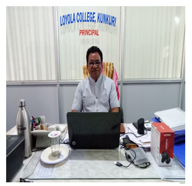
Principal Loyola College Kunkuri Dist. Jashpur (C.G.)