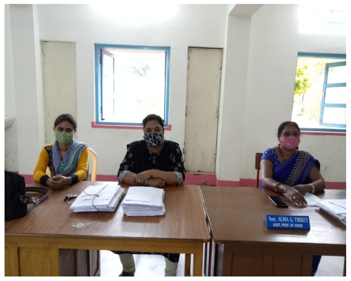
Arts Staff Members