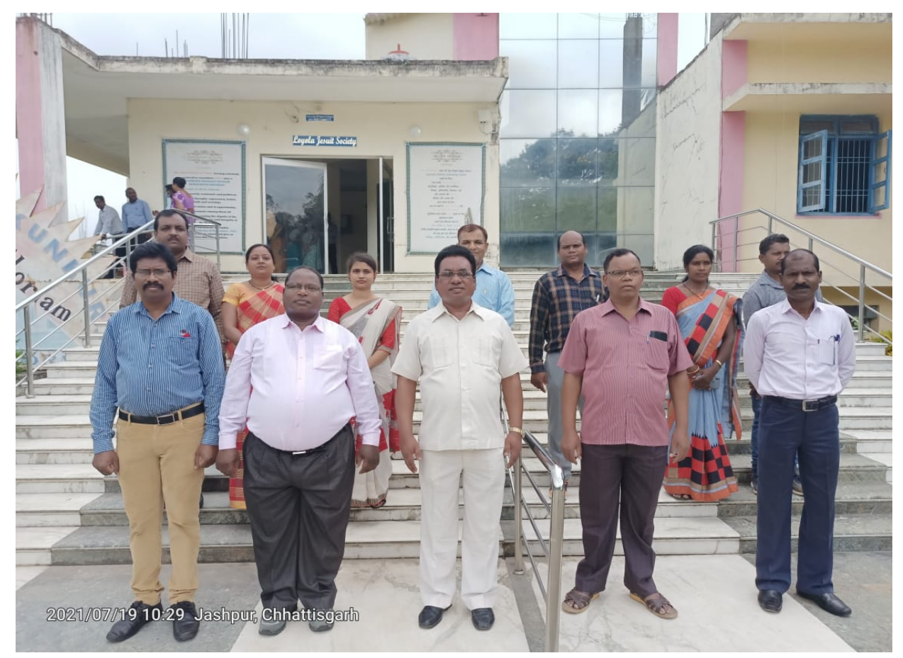
Arts Staff Members with Principal & Vice Principal Loyola College Kunkuri Dist. – Jashpur (C.G.)