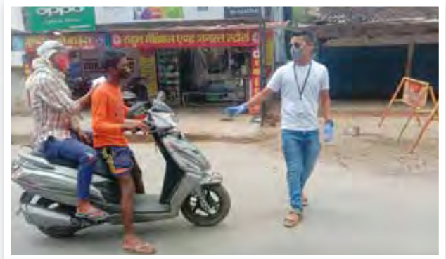
NSS Students helping Government during Lockdown