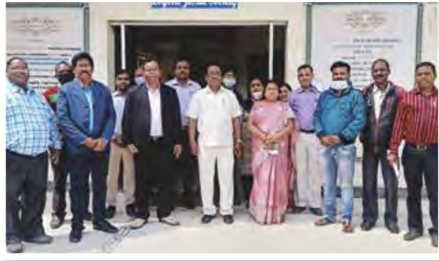
Vice Chancellor and Commissioner inspects Loyola College