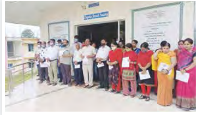
Homage to Fr. Stan Swamy, sj by Staff